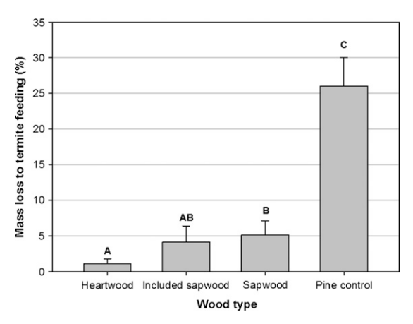
Figure 2. Mass loss after 4 wk of the exposure to Reticulitermes spp. of eastern redcedar heartwood, including sapwood and sapwood blocks. (Pine sapwood blocks are included for comparison. Different letters in each column indicate that there is a significant difference [ p \le 0.05 , Duncan's multiple range test].)

The termite resistance tests showed that P . strobus control blocks suffered the highest average mass loss (26%) (Fig 2). Reticulitermes spp. caused an average of 5% mass loss in the sapwood, 4% in the included sapwood, and only 1% average mass loss in the heartwood of eastern redcedar. All of the termites feeding on sapwood including sapwood and heartwood of the eastern redcedar had died after 2 wk. The mortality of the termites exposed to the pine control blocks was approximately 75%. According to visual evaluation, heartwood was rated as sound (average rating of 9.8), sapwood and sapwood were rated as slight attack (average ratings of 8.8 and 8.6, respectively), and P. strobus control samples were rated as very severe attack (average rating of 4.5). Average visual rating of the wood blocks reflected weight losses of all specimens. The high termite mortality in the control samples suggests that there may have been problems with the test or with the vitality of the termites; however, the observed resistance of redcedar wood is consistent with previous research. The mortality was higher than expected in termite tests done at the beginning of spring. According to the ASTM standard, if the termites live longer than 1 wk, their vitality is considered enough to have a