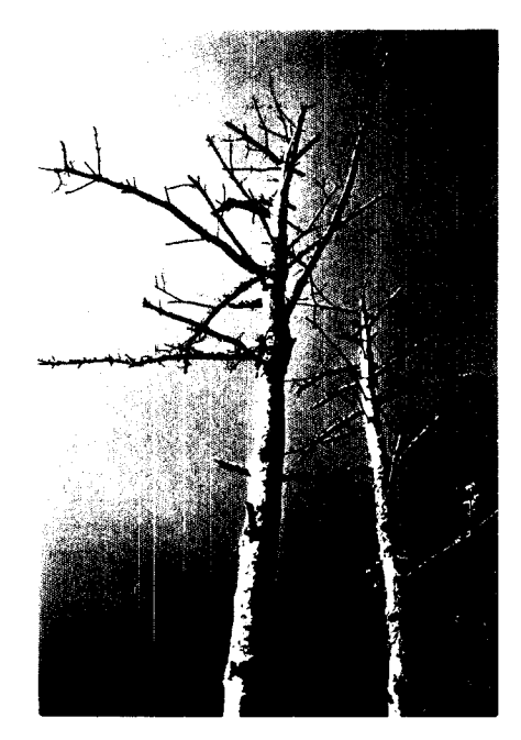
FIG. 1. Beetle-killed trees with no needles and few or no twigs. (Dead for approximately 20 months.)

Conversely, there is more lignin in the earlywood than in the latewood (Necesany and Cetlova 1963; Savory 1954). Differences of about 2% (29% in earlywood, 27% in latewood) in Klason lignin of extracted wood are typical for loblolly pine.