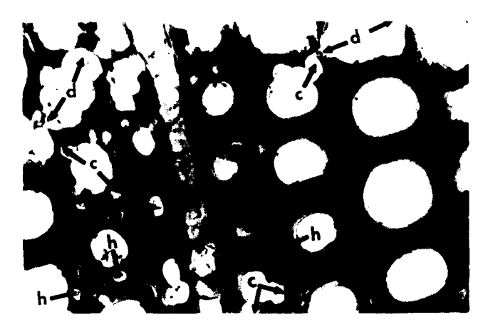
FIG. 4. Cross section of summerwood in beetle-killed loblolly pine wood; formation of cavities within cell walls (c), dark circles are fungal hyphae cut transversely (h) and dissolution of the secondary wall has been almost completed (d). Magnification 290 \times .