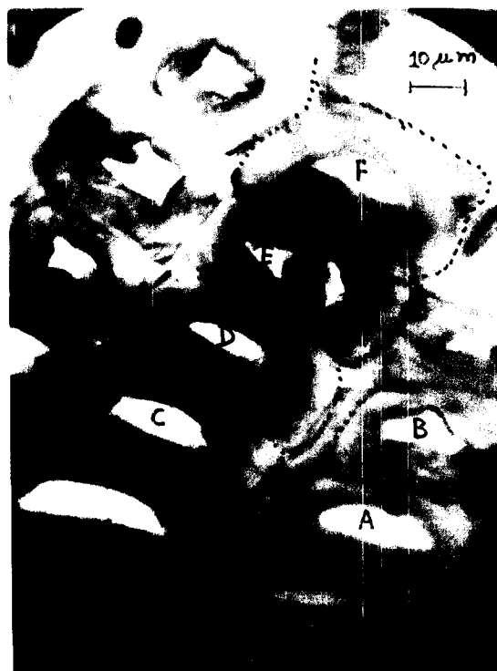
FIG. 2. Microscopic cross section of CZAA-treated white spruce from the small block (not from the plywood) with unpenetrated (A and B) and partially penetrated (C, D, E, F) cell walls of latewood tracheids. Chrome Azurol-S staining.

Microscopic examination of the inner plies for distribution of copper-containing compounds from the center of the full-sized treated panels indicated that wood tissues in the plies were thoroughly penetrated.