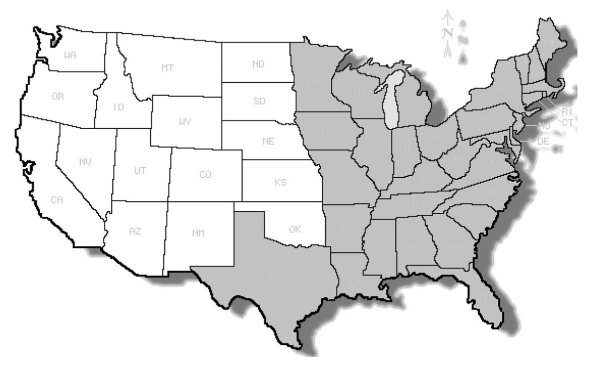
Figure 1. Comprehensive Eastern US study region.

This study chronicled solid hardwood flooring manufacture for production mills located in the eastern US. The study region is the shaded portion shown in Fig 1 and included: Minnesota, Iowa, Missouri, Wisconsin, Illinois, New Jersey, Ohio, Indiana, Michigan, West Virginia, Pennsylvania, Maryland, Delaware, New York, Maine, Vermont, New Hampshire, Rhode Island, Massachusetts, Connecticut, Virginia, Kentucky, Arkansas, Louisiana, Mississippi, Alabama, Florida, Georgia, North Carolina, South Carolina,