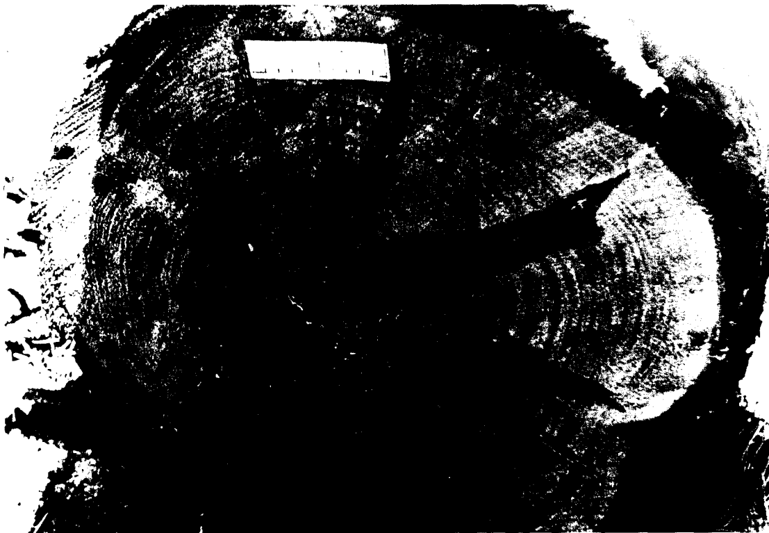
FIG. 1. Severe wet-type heart shake in 45 cm diameter butt log from Pinus elliottii grown in South Africa (label is 10 cm long).

and to recommend measures to eliminate them in future plantations.