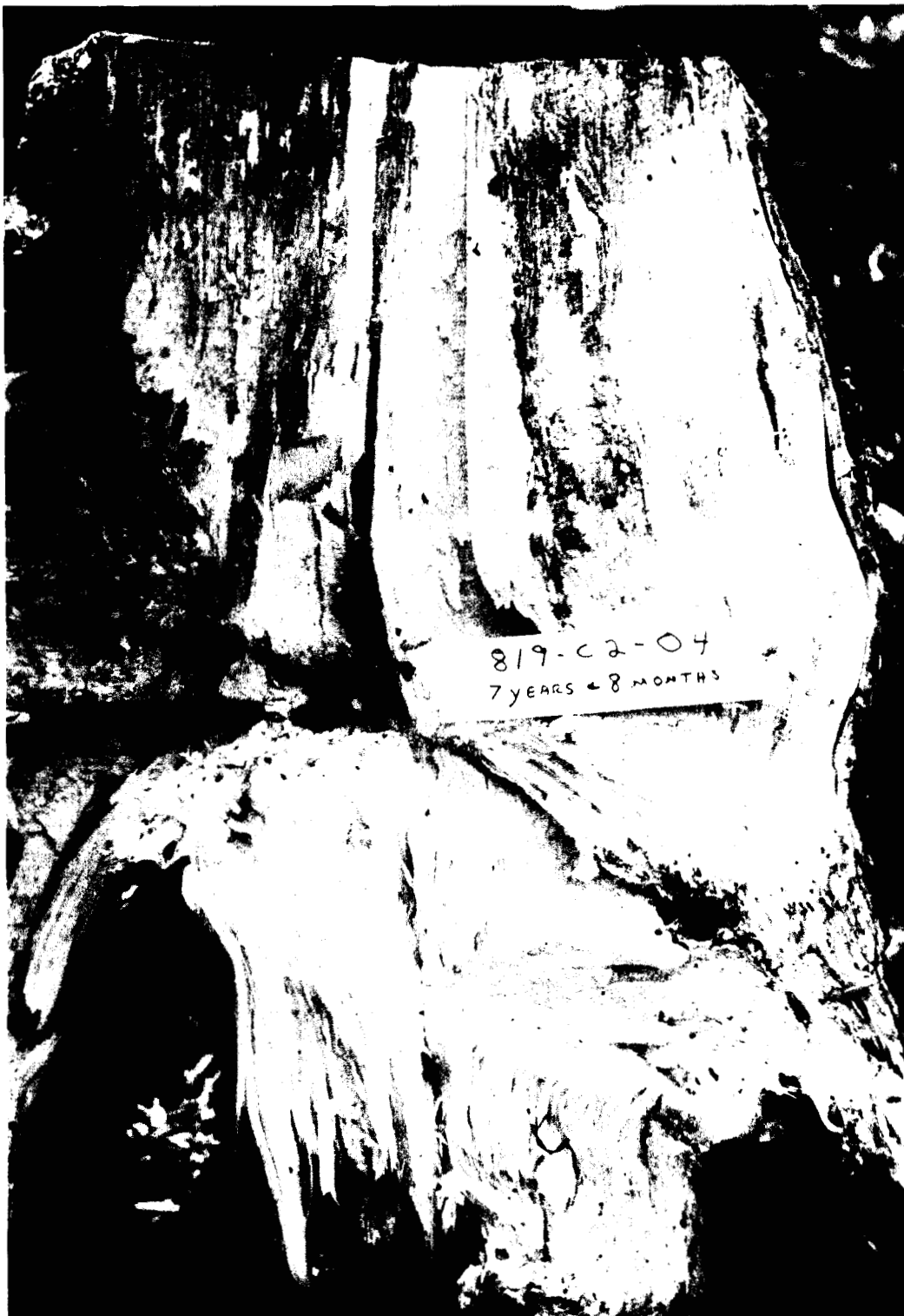
FIG. 2. Clods of nursery soil trapped in young stump near root collar. Note associated heart shake and resin infiltrated zone that extends to the stump surface (label is 10 cm long).